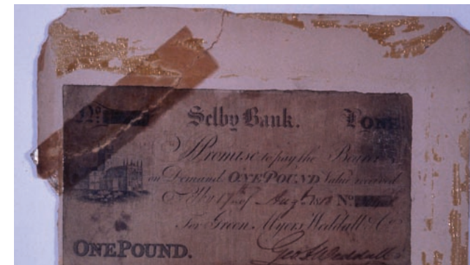
An 18th c English banknote adhered to acidic board and stained by tape adhesive

The recommendations in this leaflet are intended as guidance only. IPC does not assume responsibility or liability.