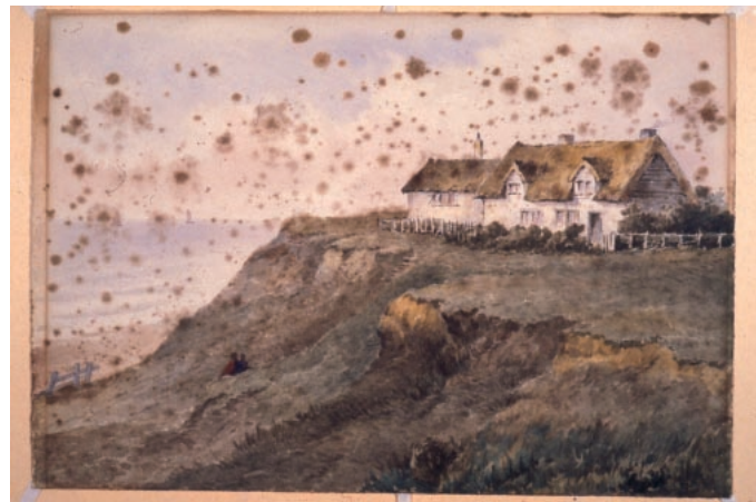
A foxed watercolour by Edward Barnard

Most owners of old watercolours, drawings, maps and prints are familiar with the disfiguring brown spots called 'foxing'. The stains are caused by bacteria or mould which generally grows on acidic paper when the humidity is high, or when metallic particles from the paper making process become embedded in the fibres.