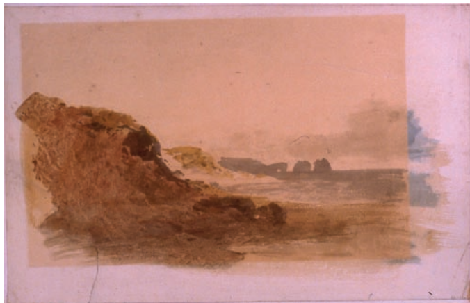
Watercolour by JMW Turner showing fading of pigments where exposed to light

Paper will turn brown and brittle when cardboard containing unpurified woodpulp is pressed against it and that is how so many framed works of art on paper are damaged. They are stained on the back and have a brown or orange line around the edge of the image where the acidic overmount has 'burnt' the paper.