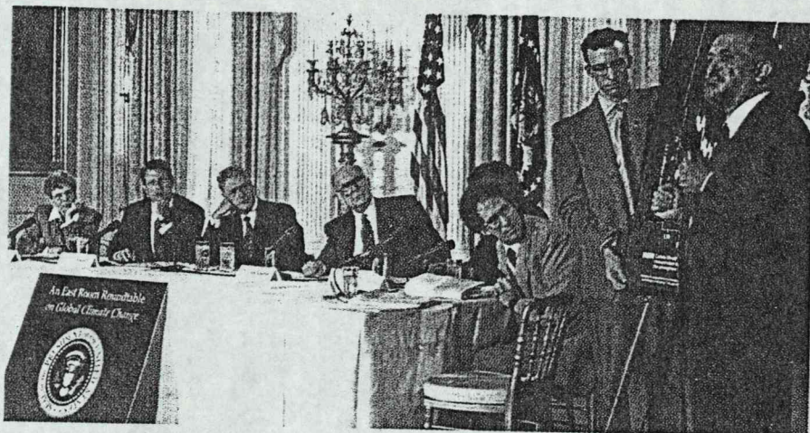
Top class: Vice president Al Gore and president Bill Clinton listen as Mario Molina (right) of MIT explains the dynamics of climate change at a heavily publicized seminar in the White House.

Clinton said after the meeting that it had been the beginning of "a consistent, long-term effort" to educate the public on the issue. "I believe it will give us the support we need to take the action that we are going to take," he said in remarks directed toward the Kyoto meeting, at which countries are due to agree